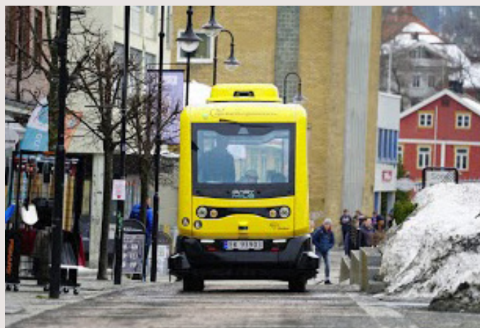
Applied Autonomy trial in Kongsberg, Norway

More trials are required, both at small and large scale. The H2020 SHOW project provides insight about relevant issues through pilot site trials in its mega-sites, satellite-sites and follower-sites across Europe.