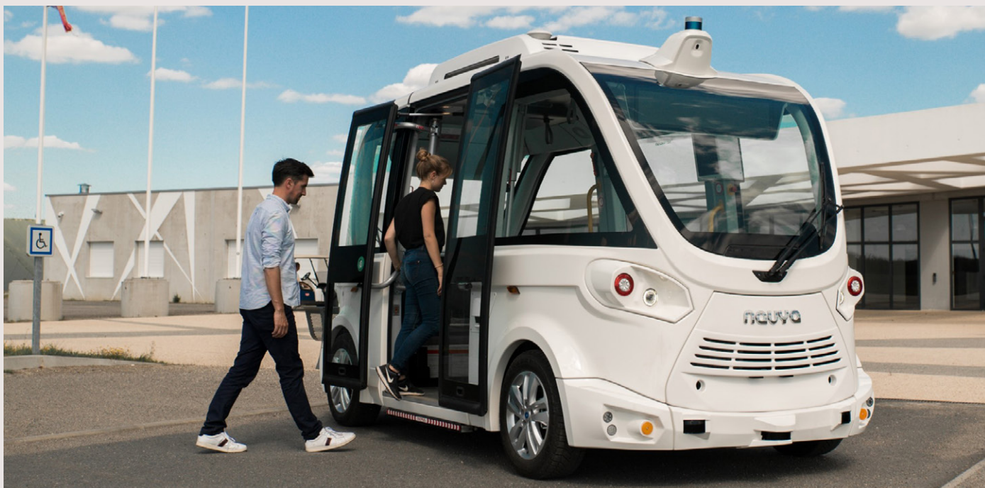
Navya trial in France without a safety operator onboard

Different countries are adopting different ACT deployment policies and approaches, varying according to wider policy objectives, environmental targets and funding available. As Shiftan et al. (2021) have highlighted though, it is the user perspective that is missing. On a positive outlook based on the review and analysis of this chapter, AV shuttles have the potential to form a deployment template for public transport.